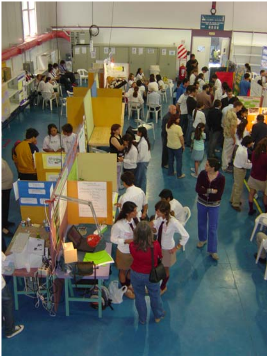
Figure 4: Participants preparing their displays at the Auger Science Fair, November 2005.

The projects were judged to be quite sophisticated, and the top projects were awarded prizes. During the Science Fair, participants were treated to presentations about the Observatory given in the Visitor Center. The collaboration is indebted to the Observatory staff, the local organizing team of 4 science teachers, and the city of Malargüe for helping to make the Science Fair a success. A second Auger-sponsored Science Fair is planned for November 2007.