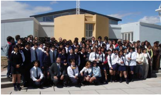
Figure 6: (Top) The front of the James Cronin School. (Bottom) Students and teachers behind the school on inauguration day.

raising ceremony, followed by a number of speeches, including Cronin, Malargüe mayor Raúl Rodríguez, and Mendoza governor Julio Cobos. The event received wide press coverage. In the evening of the same day, the students and teachers from the school held a separate inaugural celebration that included student projects on display in the classrooms, plus dance and theatrical performances by the students.